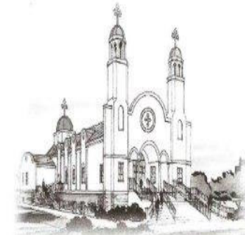
Example of Greek Orthodox Church only