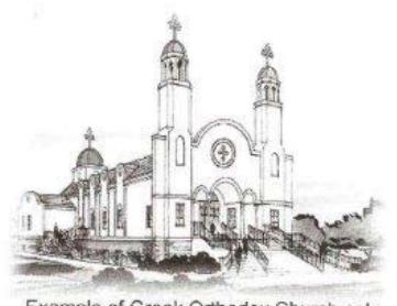
Example of Greek Orthodox Church only

* 5 bucks twice a week instead of that expensive Latte will raise roughly $500,000,000 in 4 short years!