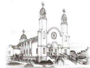
Example of Greek Orthodox Church only