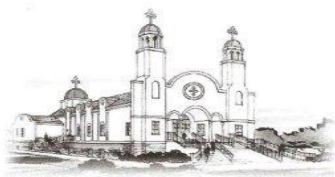
Example of Greek Orthodox Church only