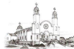
Example of Greek Orthodox Church only