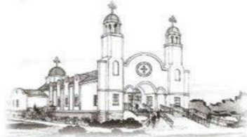
Example of Greek Orthodox Church only