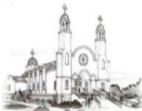
Example of Greek Orthodox Church only

* 5 bucks twice a week instead of that expensive Latte will raise roughly $500,000.00 in 4 short years!