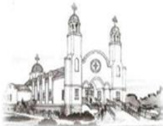
Example of Greek Orthodox Church only