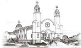
Example of Greek Orthodox Church only