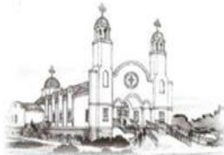
Example of Greek Orthodox Church only