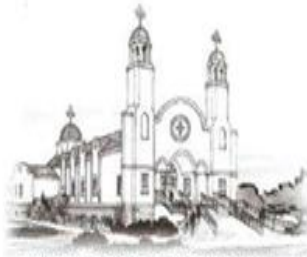
Example of Greek Orthodox Church only