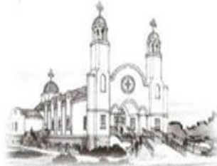
Example of Greek Orthodox Church only