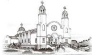
Example of Greek Orthodox Church only