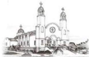
Example of Greek Orthodox Church only