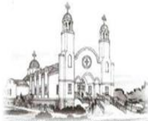
Example of Greek Orthodox Church only