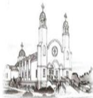
Example of Greek Orthodox Church only