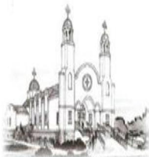
Example of Greek Orthodox Church only